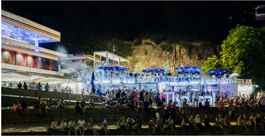
The attractivity of the International film festival in Karlovy Vary is available by the contribution of ALGECO making the facilities including complete service. The staircase towers for the lovely view are very popular. More than 30 modules are used during the festival for visitors and organisers.